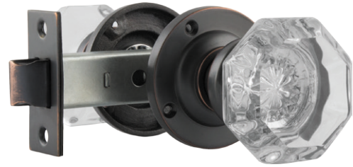
1996 tube latch with a 0711 Glass Knob in Antique Copper

This is used when the door doesn't need to be locked. It can be used with any type of door furniture, whether it's long back plate 1 , short back plate 2 , lever 3 , or knob 4 on rose. Latch simply means you need a Tube Latch 5 to make your door furniture functional.