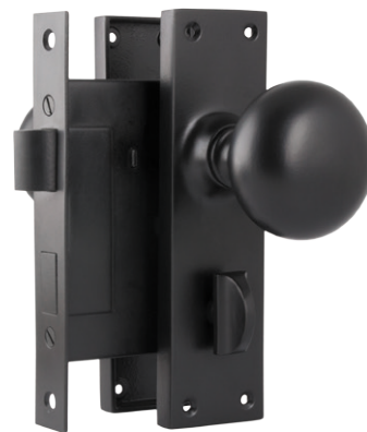
2263 Privacy Lock with a 0959P 'Victorian' Knob in Matt Black