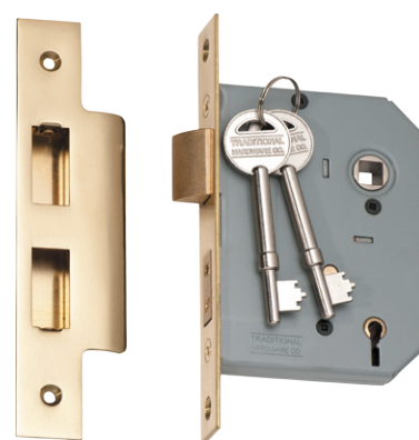
5-Lever High Security Lock in Polished Brass with 'skeleton' keys

These can be 5 Lever High Security Locks, to be used on external doors, or 3 Lever Low Security Locks to be used on internal doors. The difference between 5 Lever and 3 Lever Locks is the number of different key combinations available. 5 Lever Locks also have an 'anti pick curtain', which makes it harder to access the working components in the lock once fitted inside your door, in addition to reinforced steel pins through the locking bolt. They are suitable with any of our door furniture labelled 'Lock' in the description. These locks are supplied with a 'skeleton' key 9 . 5 Lever Locks have the same level of Security as Euro Locks. The main difference is that the 3 and 5 Lever Locks are more 'traditional' for period homes. These locks can be supplied keyed alike.