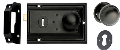
2013 Rim Lock, 0928 Milled Edge Mortice Knob set and 1188 Escutcheon