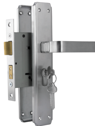
2177 Euro Lock, 2077 Euro Cylinder and 0661E 'Rotterdam' Door Lever in Satin Chrome

These are high security locks used on external doors (any door that leads to the outside of a building). They are suitable with any of our door furniture which has an 'E' (for Euro) in the description. A Euro Lock 6 then requires a Euro Cylinder 7 (where a key can be used from either end) or a thumb-turn cylinder 8 (key for outside, thumb turn inside). Euro Cylinders can be supplied keyed-alike (where the one key can open all matching locks), and are easily rekeyed by Locksmiths.